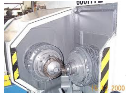
TechLap Lapping Compound